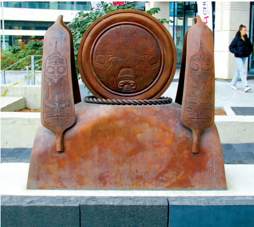
The sculpture in-situ on its plinth