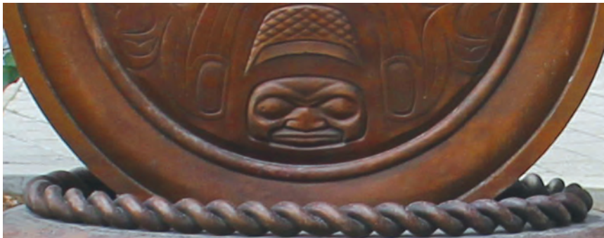
Detail of the rope element at the base of the medallion