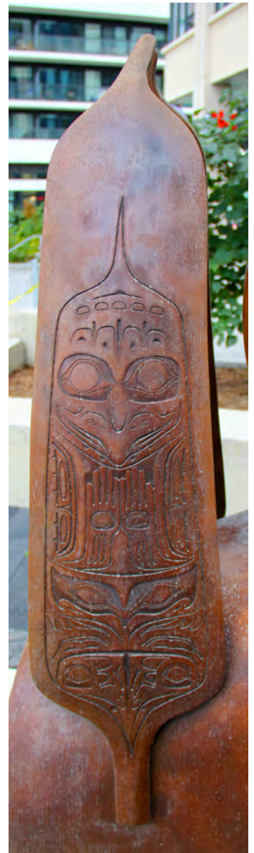
One of the four cast feathers, depicting an eagle