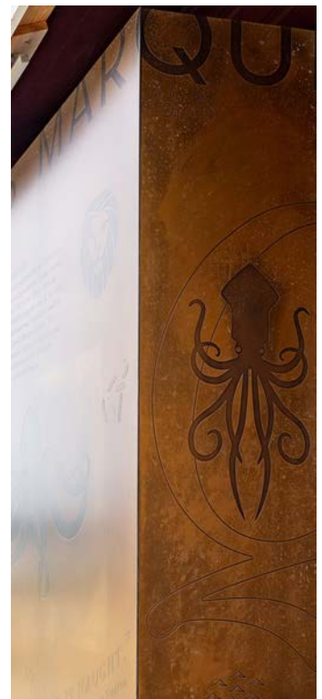
Etching detail on panel at entrance