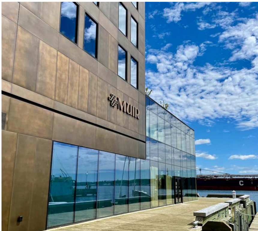
Patinated curtain wall panels at the entrance to the Muir Hotel at Queen's Marqe