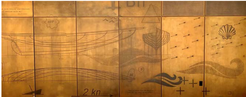
Patinated Muntz panels with etched artwork spanning across multiple panels