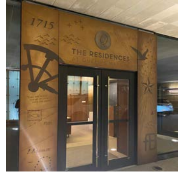
Etched panels at entrance to The Residences

Highlights - Curtain wall panels without etching cover large portions of the development with the etched panels being used to adorn the ground level elevations where shops, residences, hotel and restaurants with high traffic are. Panels are Muntz and are of varying sizes dependent on application requirements at site.