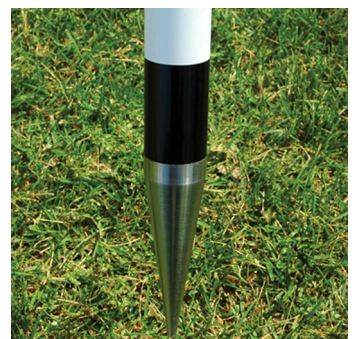
Alloy 316 stainless steel spike