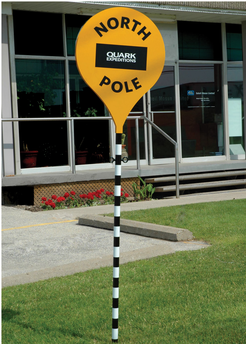
The North Pole Sign planted in the ground.