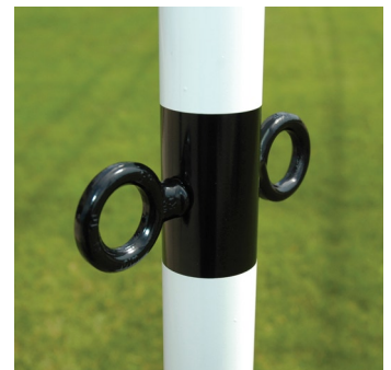
Welded support eyelets