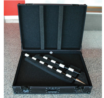
The sign collapsed into it's custom flight case

Highlights - The sign is 8' tall with the top portion of the sign being 2' wide. The sign is made of three (3) pieces which are collapsible and they mechanically fasten to each other. The sign is made of marine grade alloy 316 stainless steel. Sign top is powder coated yellow with the pole being powder coated gloss black with vinyl striping. The sign features applied vinyl graphics which are durable and replaceable.