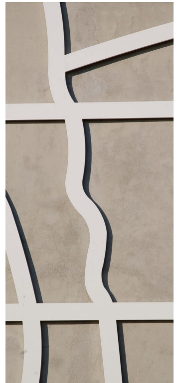
Detail view of laser artwork