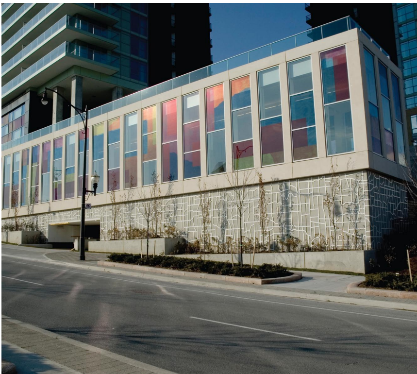
The Map Wall Artwork at Concord Park Place in Toronto