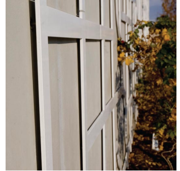
Mechanical fastening with 1/4" relief from wall

Highlights - This Map Wall Artwork is laser cut from 1/4" carbon steel panels, zinc plated and white satin finish powder coated. The Map Wall is mechanically fastened to the plinth wall of the building. The East and South portions of this wall are paneled with the artwork that wraps around both elevations including the parking garage exterior wall along Esther Shiner Blvd and continues around into the enclosed garden of Concord Park Place.