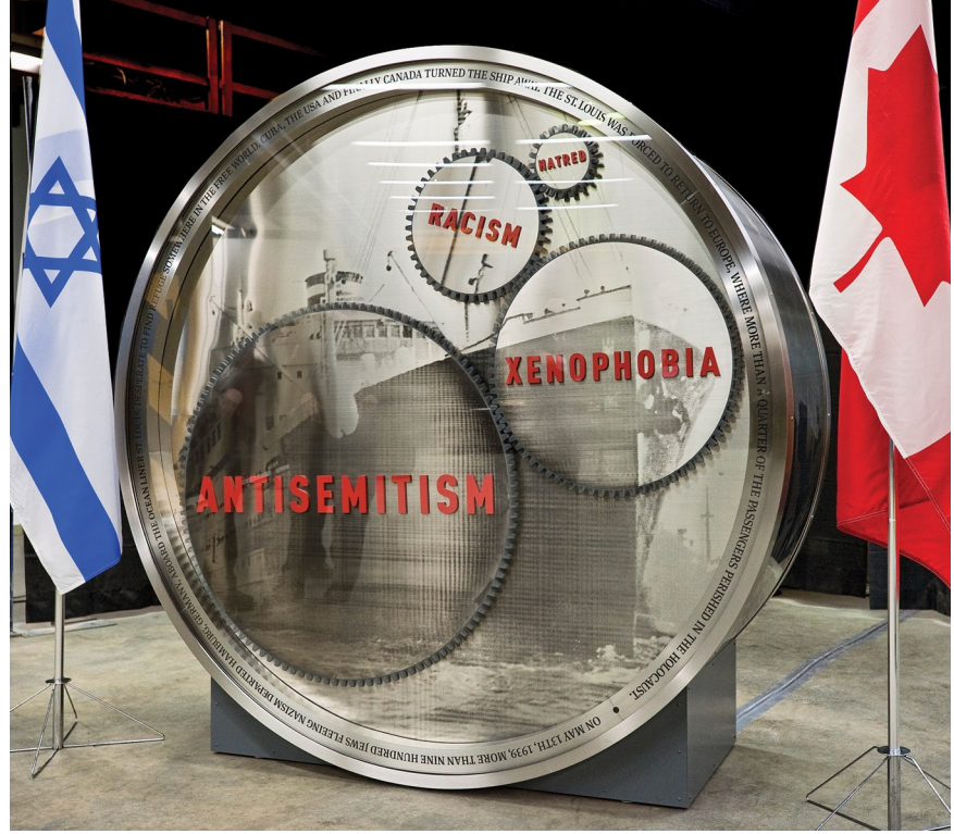
The Wheel of Conscience monument which memorializes the voyage of the M.S. St.Louis