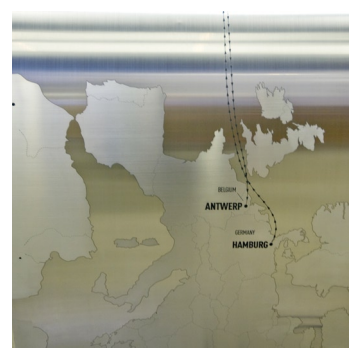
The cylinder side with etched route of the voyage