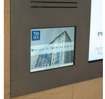
Detail of the lobby directory

Highlights - The custom air intake louvers are fabricated from painted aluminum extrusions which frame stainless steel architectural mesh panels. The lobby directory face panel was fabricated from stainless steel with water jet cut out openings for screen and speakers. Custom concealed hinging keeps panel flush with stone wall. In January 2010, SML was selected the winner of the Washington Building Congress Craftsmanship Award® which recognizes SML's outstanding skill and achievement on its scope of work for the 700 Sixth Street NW project.