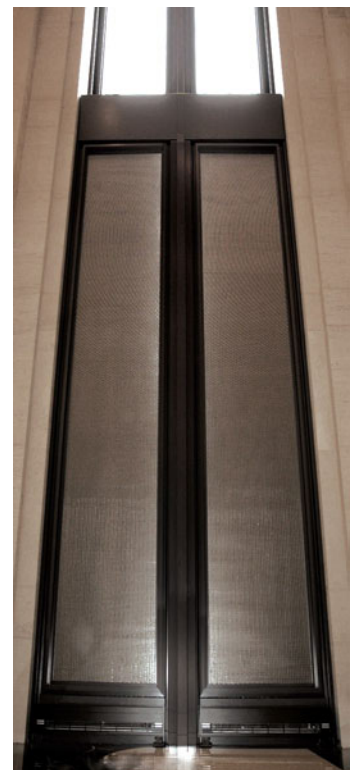
Custom stainless steel mesh louvers