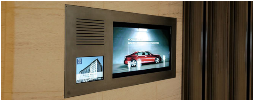
The touch-screen lobby directory