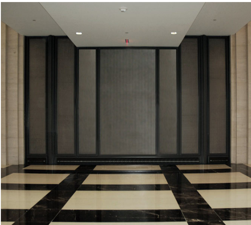
Center set of custom air intake louvers