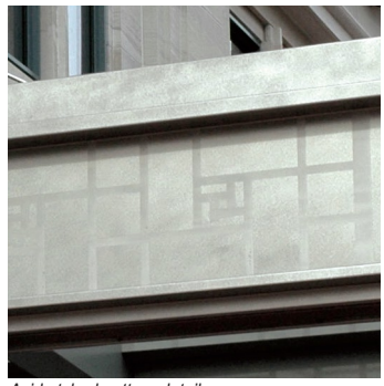
Acid etched pattern detail