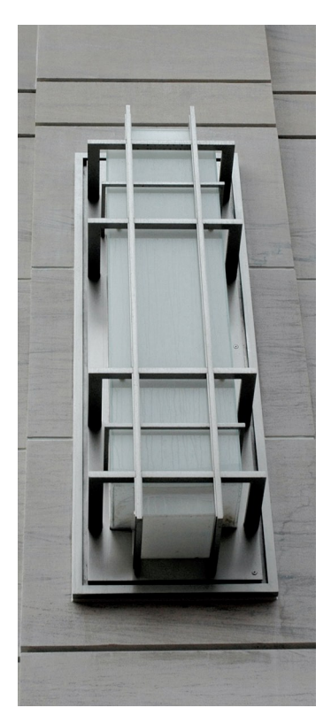
Chinese lantern style exterior light grille