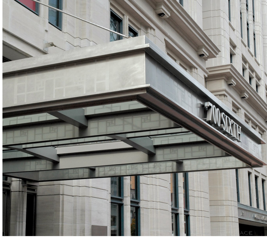
Stainless steel canopy cladding with etched pattern