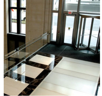
Glass floor and entrance from above

In January 2010, SML was selected the winner of the Washington Building Congress Craftmanship Award® which recognizes SML's outstanding skill and achievement on its scope of work for the 700 Sixth Street NW project.