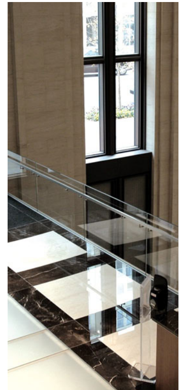
Glass floor and balustrade from above