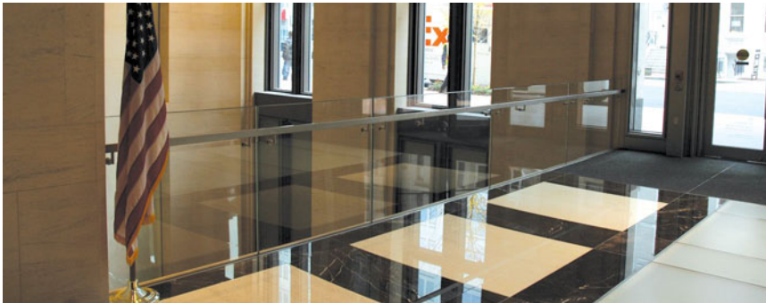
Glass balustrade and railings over the concourse