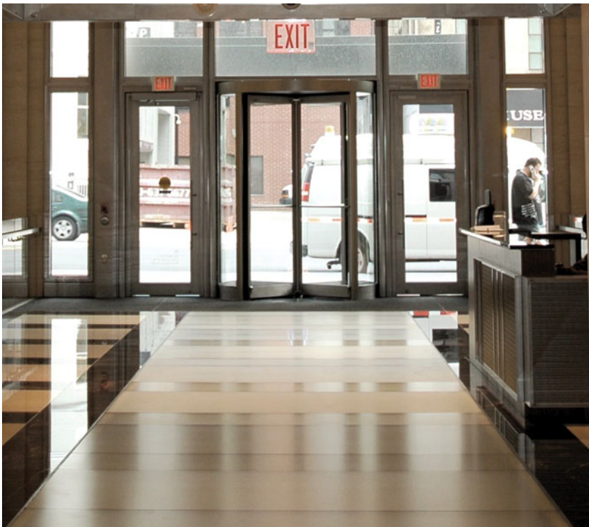
Inset glass floor as seen looking towards the main entrance