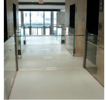
Second floor view from glass bridge

Highlights -This bridge was engineered and fabricated by Soheil Mosun Limited and includes 1-3/4" thick, 4-layer laminated glass panels with fritted surface to provide a translucent, non-slip finish. All framing was fabricated using 1" solid stainless steel plate with SML's special orbital, non-directional finish. Glass balustrades around the bridge were fabricated from laminated glass, with stainless steel handrails and custom machined hardware. In January 2010, SML was selected the winner of the Washington Building Congress Craftsmanship Award® which recognizes SML's outstanding skill and achievement on its scope of work for the 700 Sixth Street NW project.