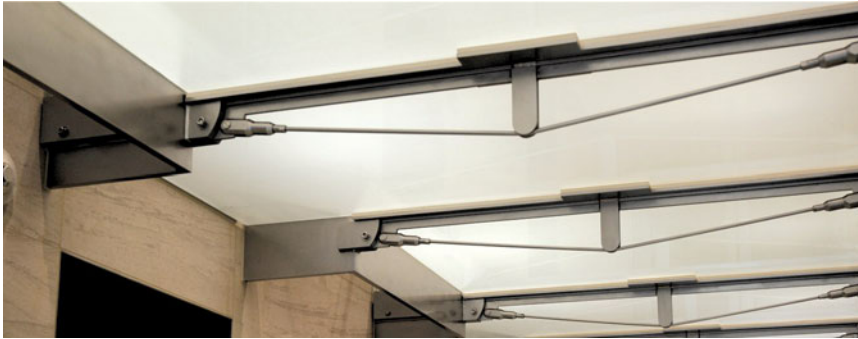
Stainless steel rods and adjustable clevis support system