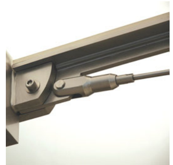
Clevis jaw hardware detail