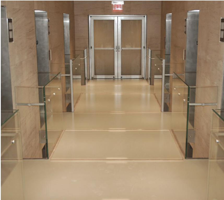
Glass bridge services elevator entrances