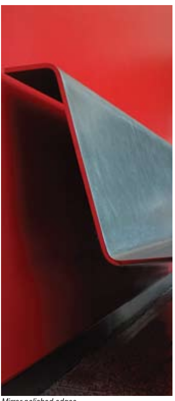
Mirror polished edges