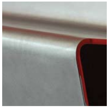
SML's special non-directional orbital finish