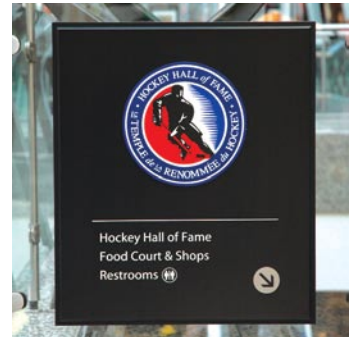
Painted & silkscreened wayfinding sign