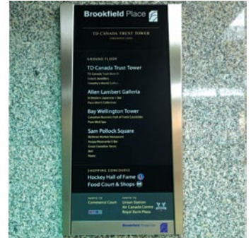
Stainless steel and glass elevator directory

Highlights - These directories and signs are varied in materials and design to suit the location they are in, within the Brookfield Place office complex. Materials range from 1/4" stainless steel and tempered 1/4" glass inserts for the upright brochure holders and directories to modern molded plastics and aluminum for wayfinding signage.