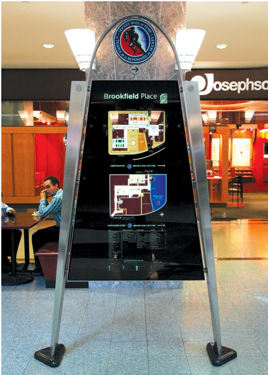
Floor mounted stainless steel & glass directory