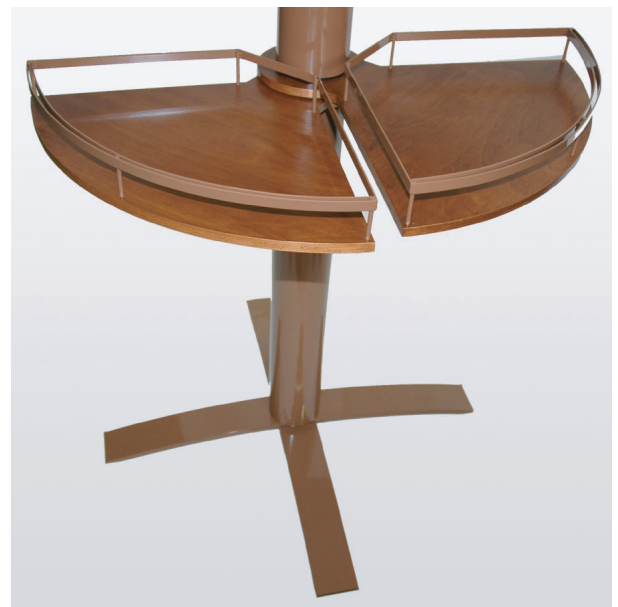
(2) stained and lacquered wood veneer shelves