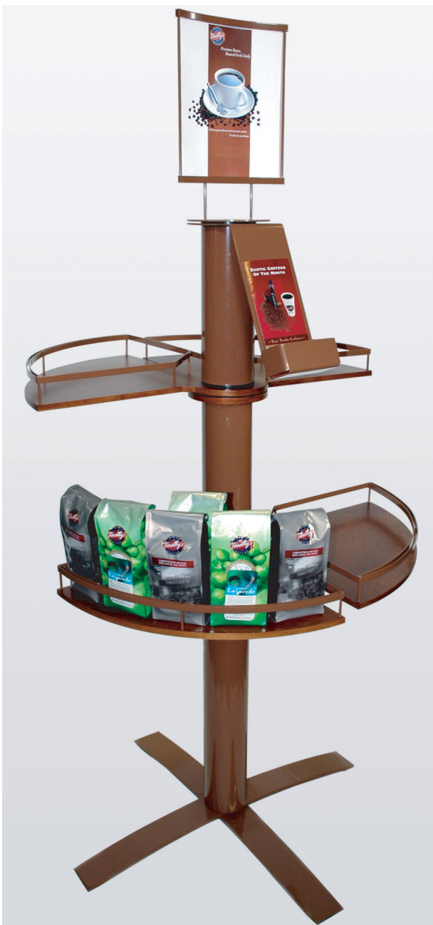
6' tall freestanding point of sale display

Highlights - The 6' tall freestanding unit has a base comprised of solid 1/2" steel which supports a steel center post. The steel center post is fitted with aluminum sleeves which allow various configurations of up to (5) stained and lacquered wood veneer shelves per node. All steel and aluminum components are powder coated. The top incorporates a pamphlet holder and a curved 8 1/2" x 11" sign holder.