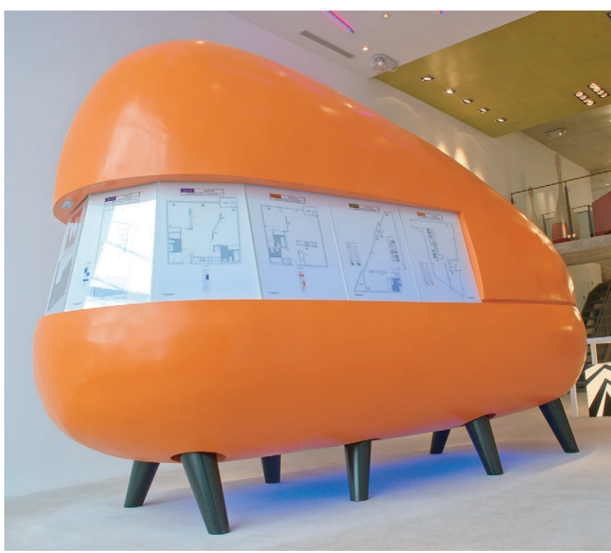
The Blob organic condominium floor plan display unit