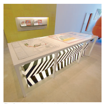
The Box under scale model table

Highlights - The Blob is an approximately 16' long x 9' high x 6' wide organic shape on legs, with backlit graphic windows, computer-controlled, multi-coloured internal LED illumination, and concealed belly-mounted, coloured fluorescent indirect lighting. Construction is a wood framework, over-sprayed with foam, sculpted and sanded, then covered with a sprayed plastic hard shell and painted. The Tooth is a functional and stylish reception desk, using the same wood / foam / plastic / paint system as was used to produce The Blob. The Box is a wood with plastic laminate table designed to support a full-size site plan drawing and a 3-D scale-model of the development, that sits astride a black-striped, internally illuminated, fabricated, translucent white, acrylic box.