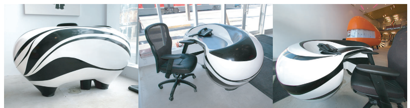
The Tooth reception desk (front view)