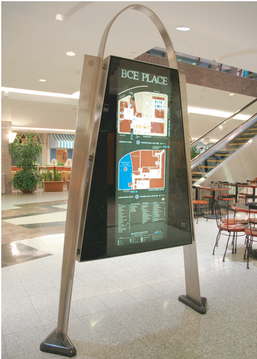
Concourse retail directory