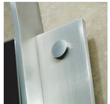
Decorative rosette on linear brushed st. stl. frame