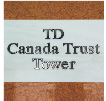
TD Canada Trust Tower interior identification

Highlights - The flat wayfinding directory found upon entering from Bay street is made of brushed stainless steel frame structure. The concourse retail directory is made of brushed st. stl. arch frame - both are equipped with internally illuminated sign face graphics. The individual letter identification is made of waterjet cut 1/8" thick mirror polished st. stl. letters mounted onto 1/4" thick waterjet cut black anodized aluminum letters. The total signage package program smoothly integrates into the buildings' architecture.