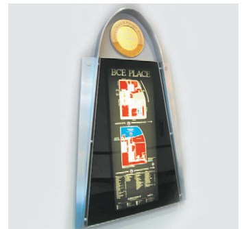
Wall mounted concourse retail directory