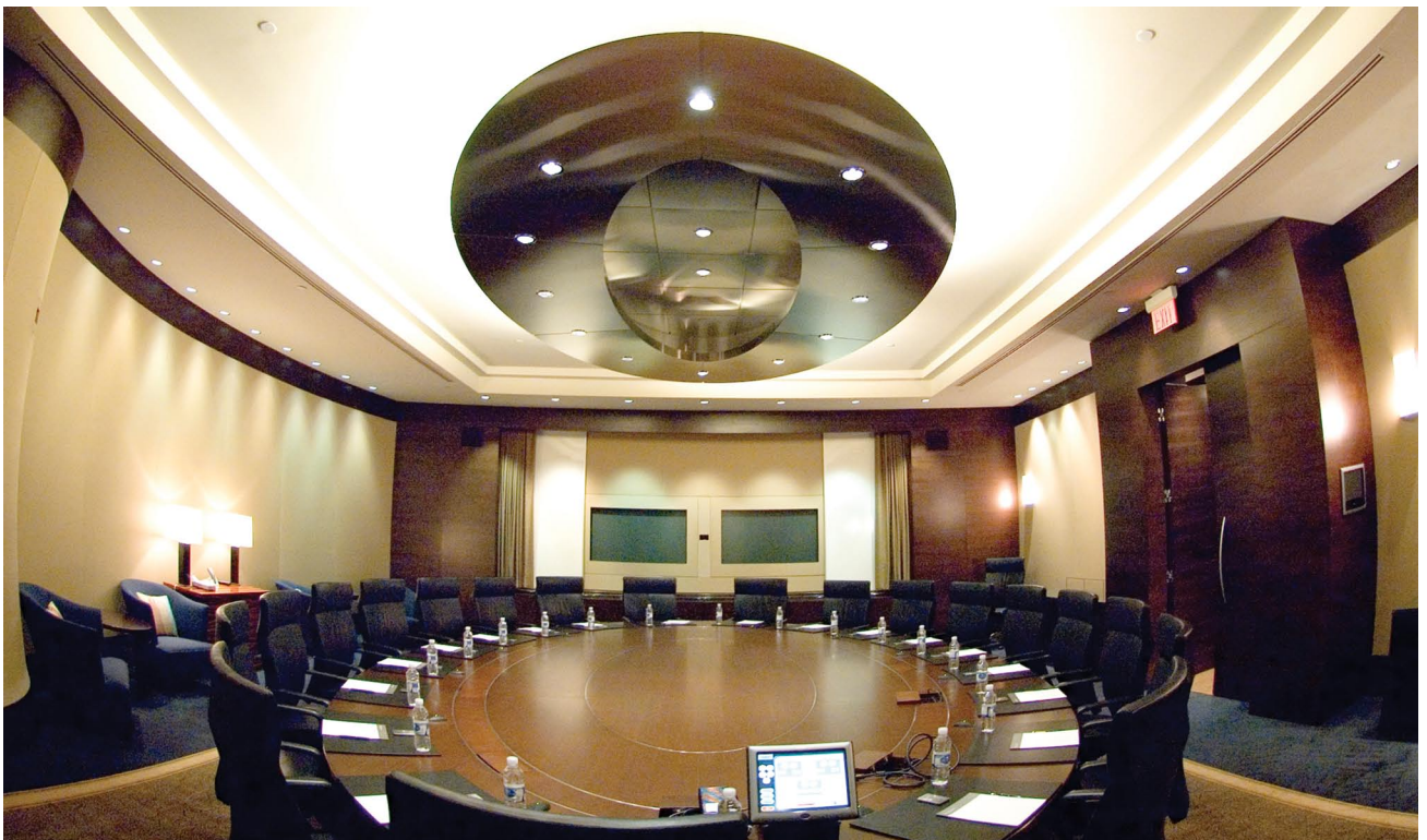
The ceiling fixture installed in the next generation boardroom at the Intercontinental Hotel in downtown Toronto.