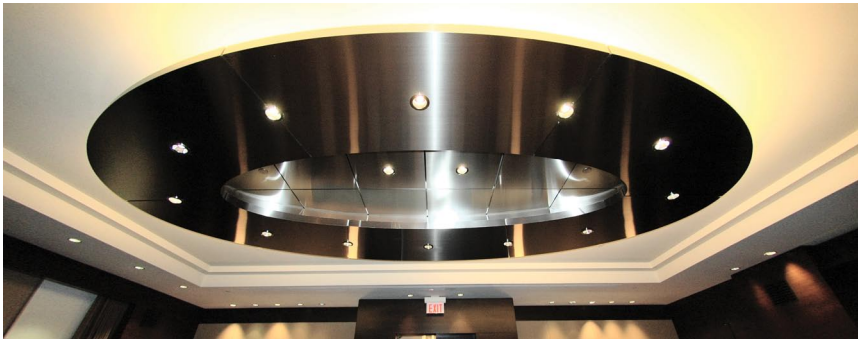
The brushed steel look adds a cool elegance to the boardroom