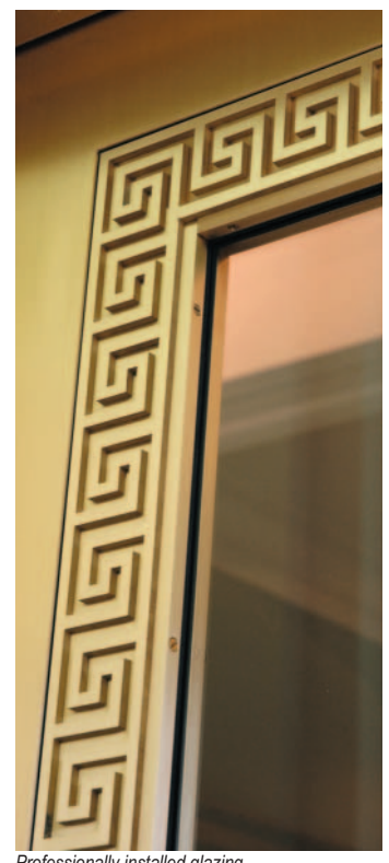
Professionally installed glazing