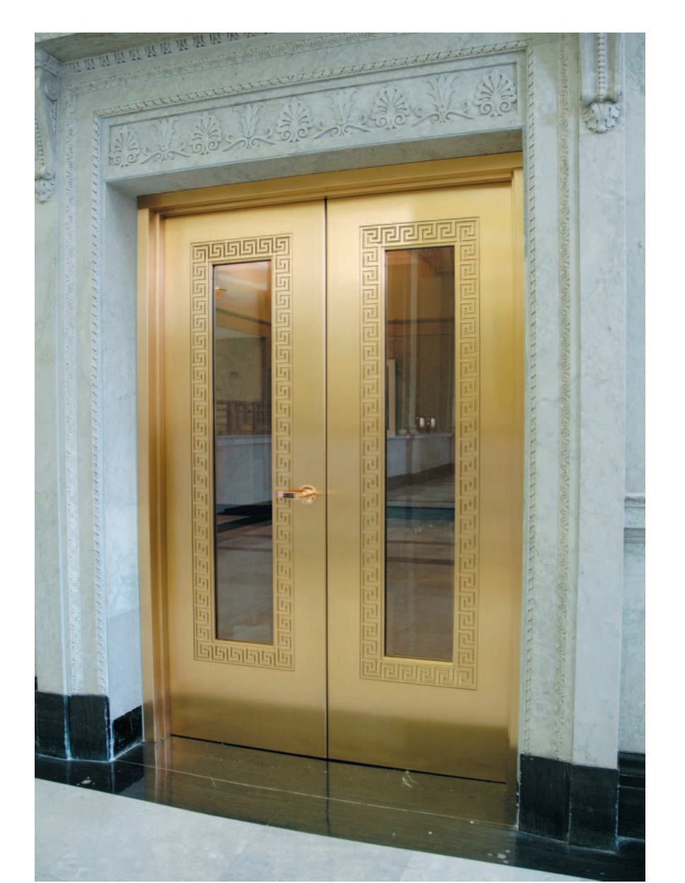
Steel-framed, bronze-clad doors with glass panels