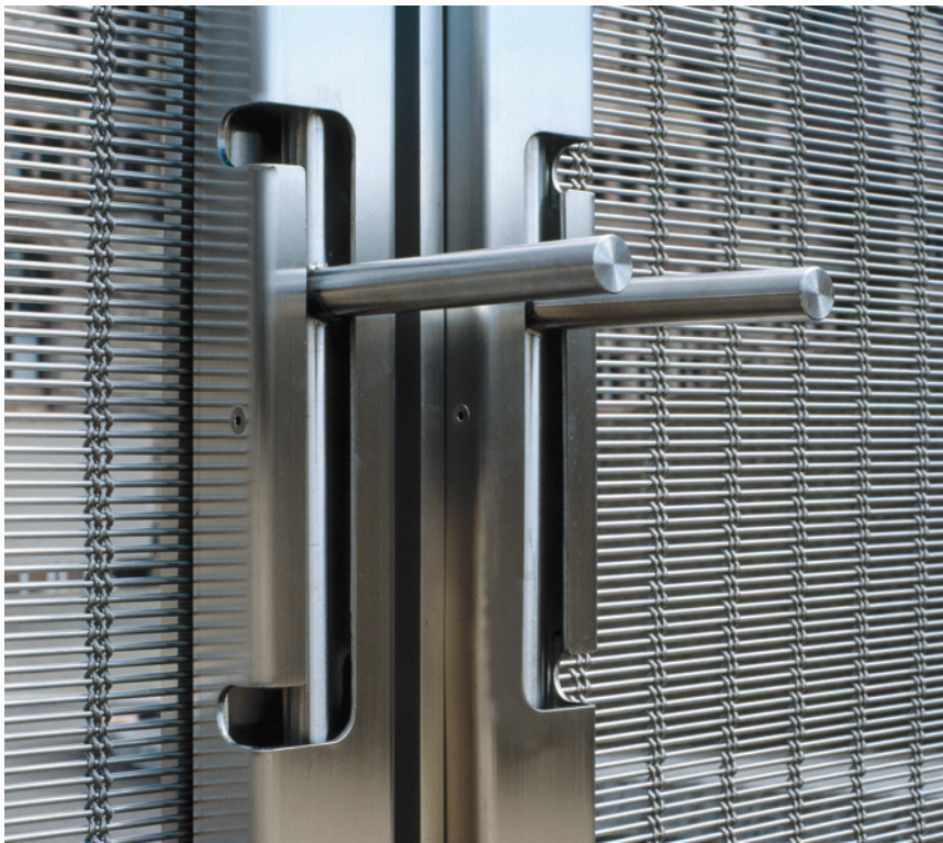
Down-bolts on south ramp gates