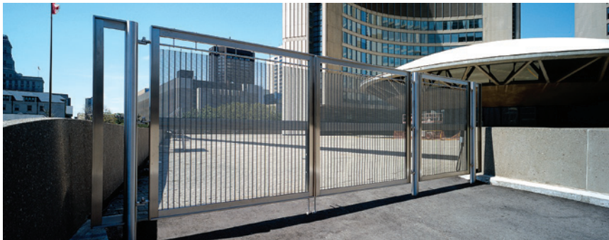
Gates at south ramp

Highlights - This project was featured on the cover of April's issue of Canadian Architect.