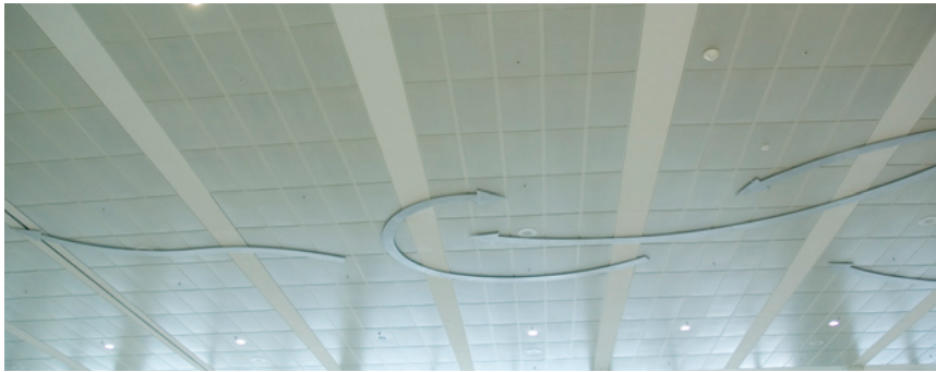
The View of the Front of the Sculpture Facing North