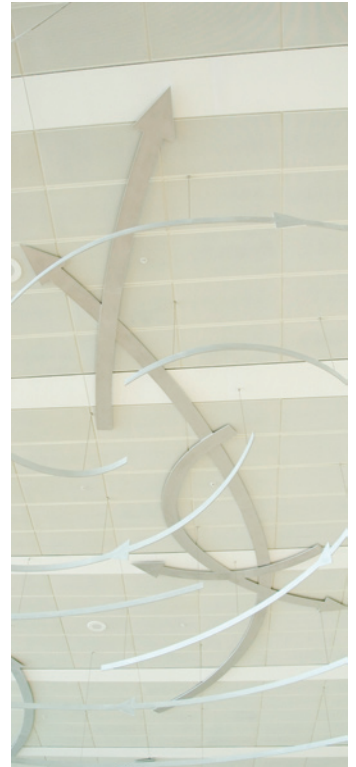
Detail of Intricate Elements of the Sculpture