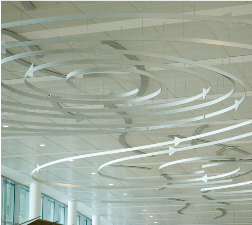
The View Showing the Dimension, Complexity and Depth of the Sculpture