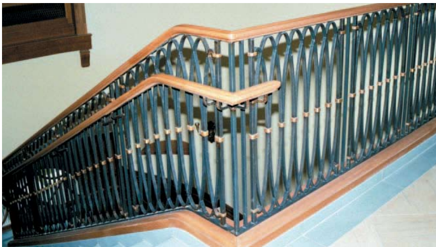
Guardrail and handrail