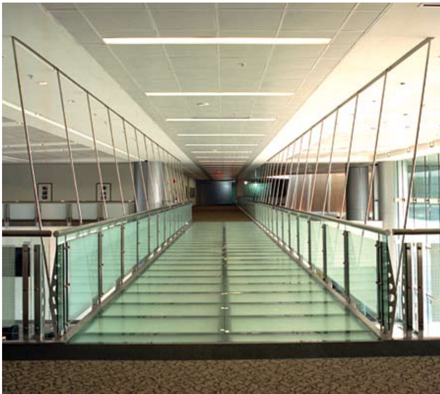
75'-0" suspension bridge