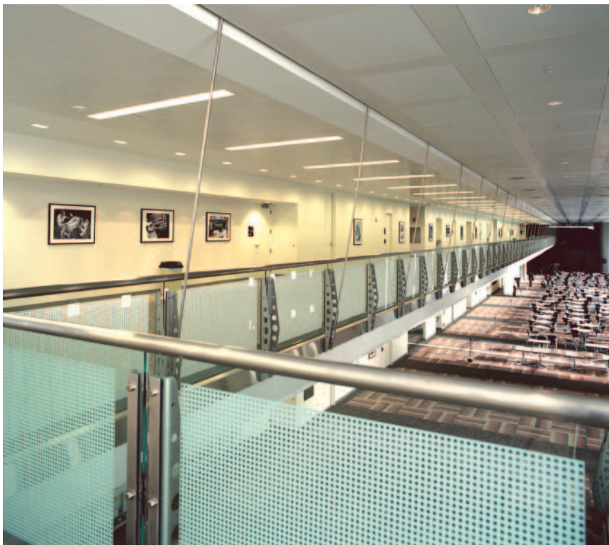
Cantilevered floor supported by stainless steel suspension rods