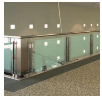
Custom designed corner detail