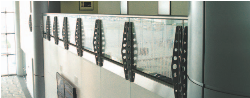
Fritted tempered glass panels

Highlights - Field dimensions yielded slab alignment variances in excess of 4" off plumb. Our designers and site forces overcame this problem by introducing structural shims that resulted in a "gun barrel" straight installation. Over 200 fritted glass panels and 1300 lineal square feet of balustrades.