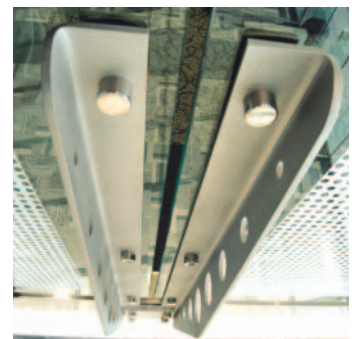
Custom stainless steel posts - shot blasted finish