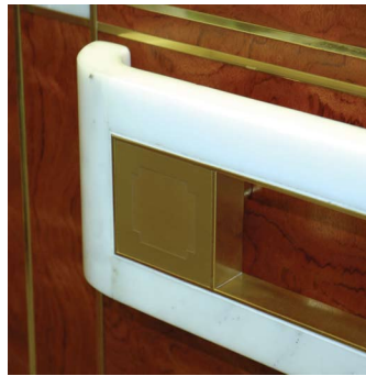
Detail of the White Marble Hand Rails