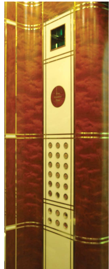
Marble Operating Panel with Brass Inlays