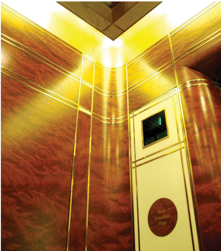
Bubinga Wood Veneer with Polished Brass and Marble Inlays