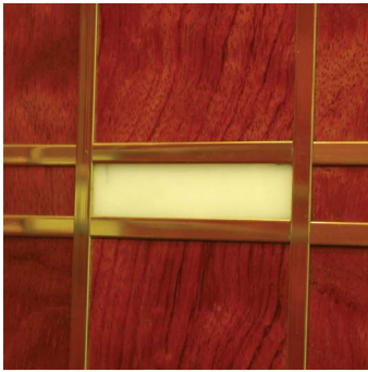
Detail of the Marble and Brass Inlays

Highlights - Drop ceiling fabricated in two types of marble completed with polished brass inlays, back-lit with compact fluorescent lighting as well as recessed down lighting. Rear and side walls fabricated with "Bubinga" veneered wood paneling with polished brass inlays. Flooring made from custom water-jet cut shaped marble tiles completed with polished brass inlays. Doors clad in polished brass metal.