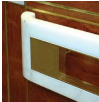
Detail of the White Marble Hand Rails