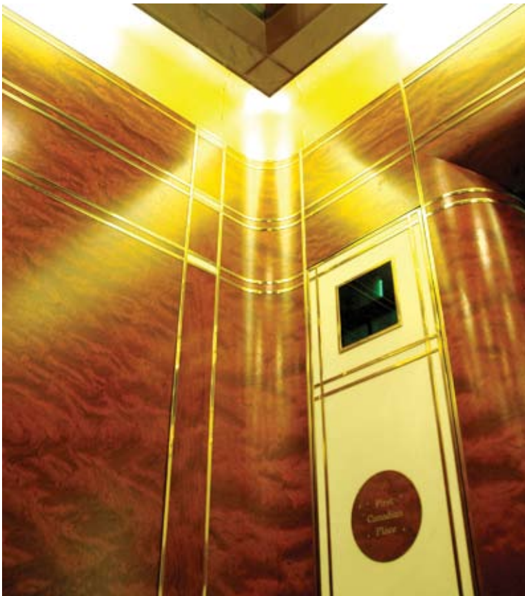
Bubinga Wood Veneer with Polished Brass and Marble Inlays