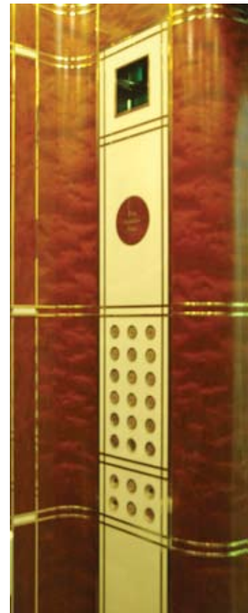
Marble Operating Panel with Brass Inlays