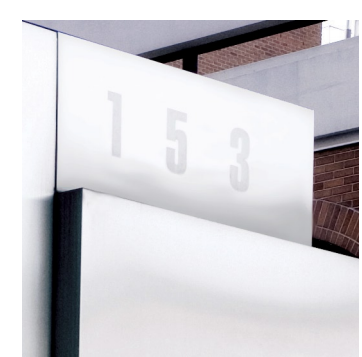
Etched address identifier