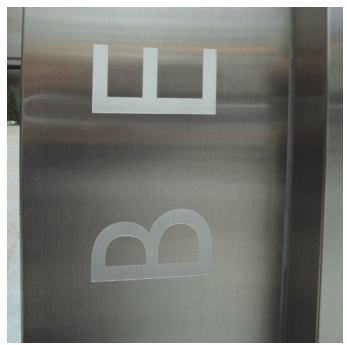
Precision acid etching