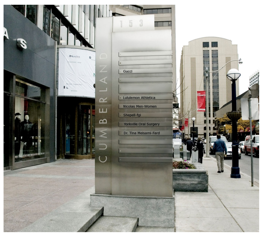
Facing west, the Pylon sign dominates and compliments surroundings