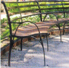
Battery Park - Benches