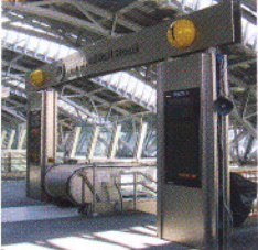
Jamaica AirTrain Station - Signs