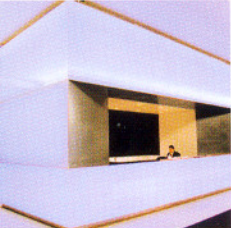
142 W 57th St - Lobby Interior