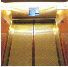
Brookfield Place - Elevator Cabs