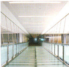
General Motors - Glass Bridge