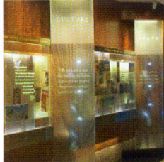
Four Seasons Hotels - HQ Lobby