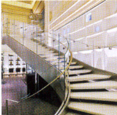
Tiffany & Co - 37 Wall St. Interior