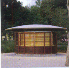
Battery Park - Kiosks