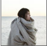
Exhibit celebrates centennial of Women's College Hospital