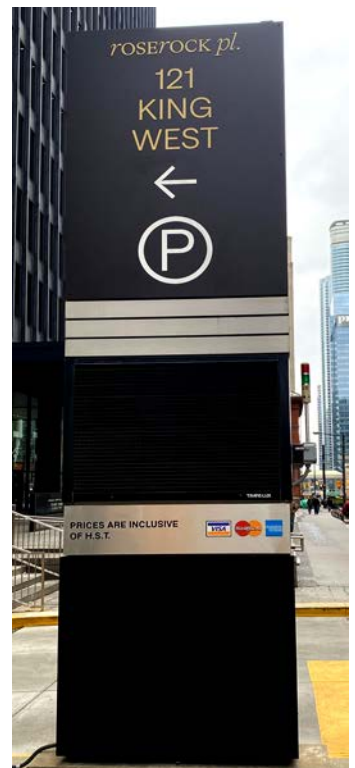
Parking lot pylon indicator sign