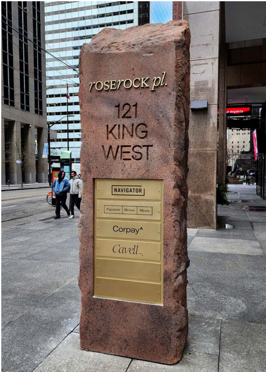
One (1) of the Composite aggregate pink granite pylon building identification and tenant sign