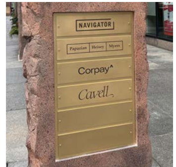
Detail of muntz bronze tenant sign on pylon