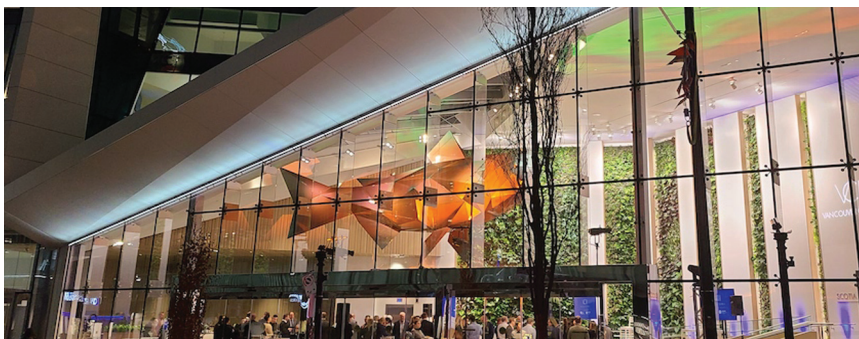
"Spawn" as viewed from the exterior at street level