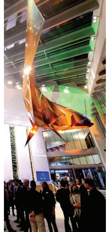
"Spawn" as viewed from the rear approach

Highlights - Custom suspended Salmon sculpture, approximately 30'-0" long x 13'-8" high, fabricated from .090 thick stainless steel with a multi-colour Chameleon effect paint finish. Custom suspension system comprised of steel cable and custom made stainless steel mount and gromet system, and is installed approximately 15' from the floor.