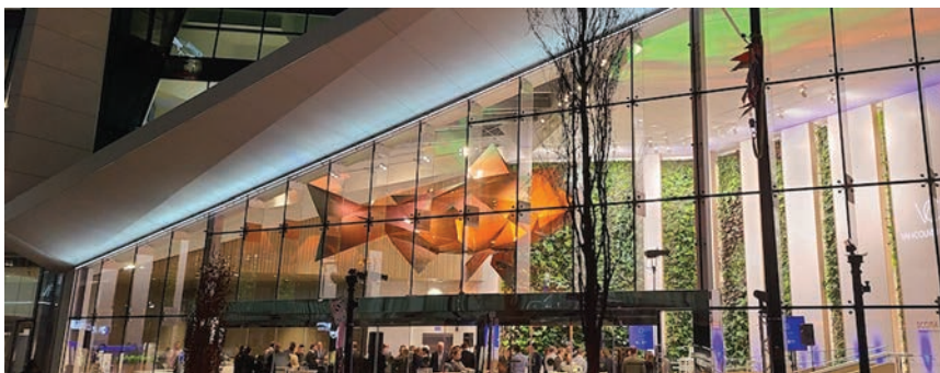
"Spawn" as viewed from the exterior at street level