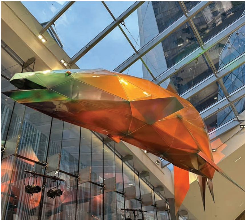
"Spawn" as viewed from below within the atrium of Vancouver Centre II