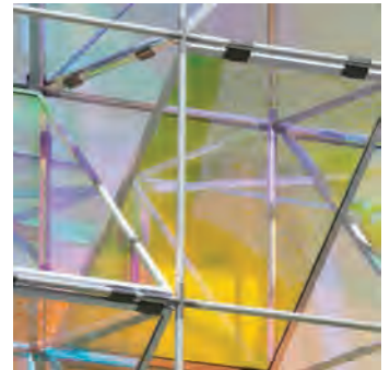
Detail of frame and lenses