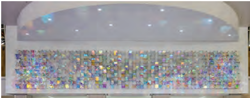
The sculpture beneath the gate canopy