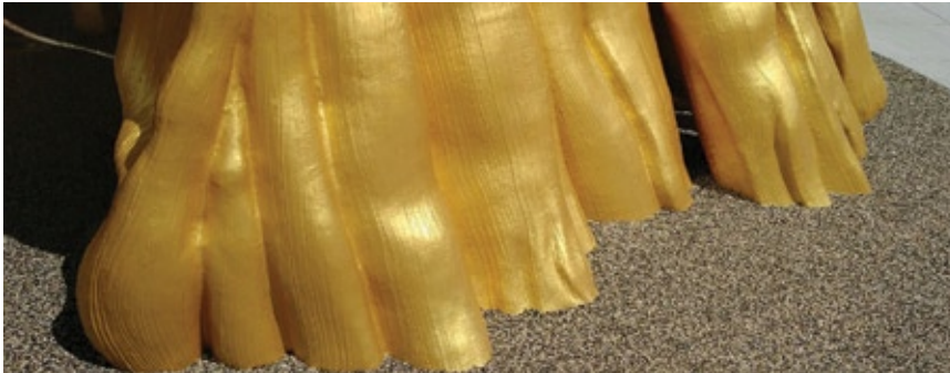
Detail of the base of the Golden Tree as viewed from its exterior.