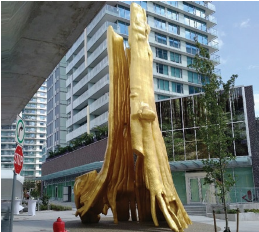
42' high The Golden Tree is at the corner of Cambie and Marine Dr in Vancouver.