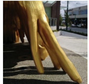
The roots of the Golden Tree