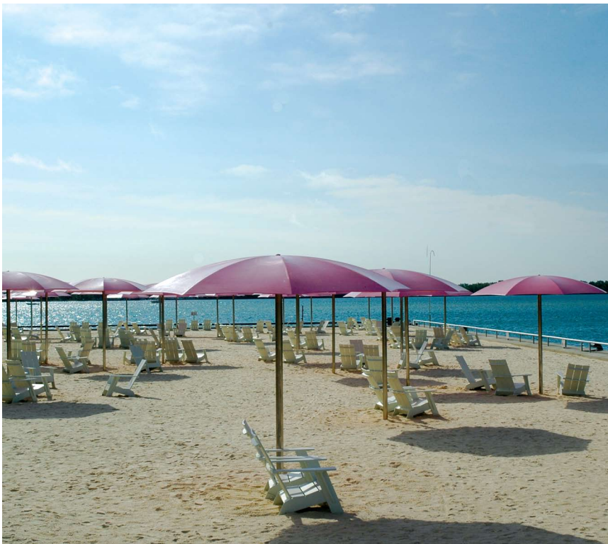
View of the beach umbrellas facing Lake Ontario