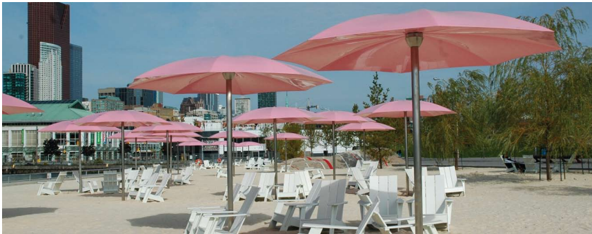
Several of the beach umbrellas against the Toronto skyline