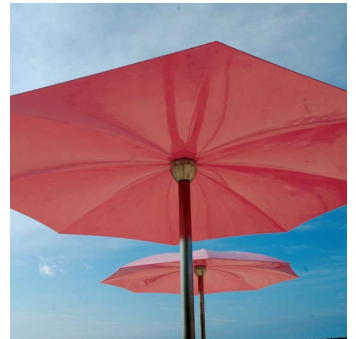
Detail from beneath the beach umbrella