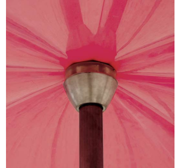
Detail of LED light housing

Highlights - These durable beach umbrellas each have a post and spoke substructure made of alloy 316 stainless steel and fiberglass formed umbrella tops which cover the substructure spokes and serve to hide the internal electrical system that powers the embedded LED lights in the inside centre of each beach umbrella. The poles are 11' tall and each umbrella top is 8'-6" wide in diameter.