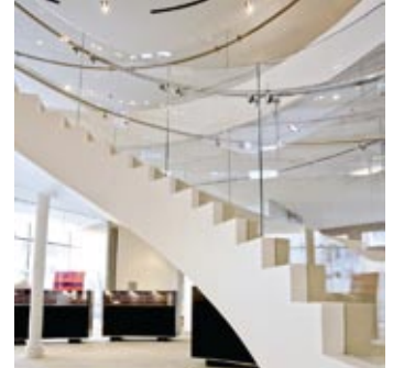
Detail of balustrades and railings

Highlights - Set in the center of the store, this staircase spirals in two continuous 180 degree half circles, through three levels to a height of 28'. The rolled and reinforced HSS primary stringer structure was engineered to support the substantial loads imposed by the 1 1/2" thick polished white limestone treads and risers, the seamless white plaster cladding at the edges and underside as well as the curved, tempered, Starfire glass guardrails. The matching balustrade glass and smoke baffle glass enclose the 16' diameter floor openings while the rolled, welded and seamless 1 1/2" diameter brushed stainless steel handrails and brackets provide support and continuity.