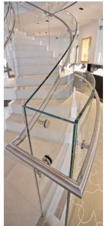
Detail of the custom handrail