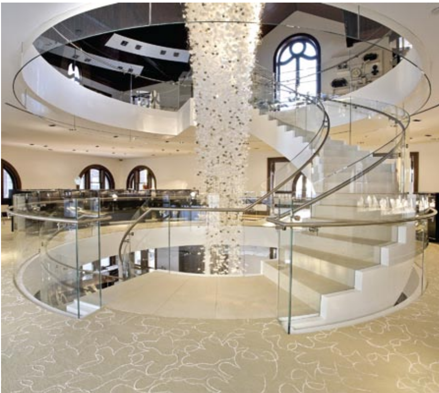
The monumental spiral staircase in-situ at the OC Tanner flagship store