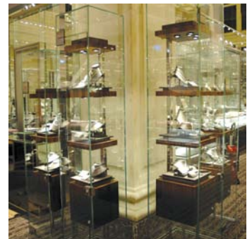
Tower vitrines of glass, millwork and steel