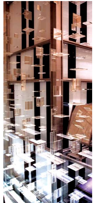
Close-up view of glass wall with fins