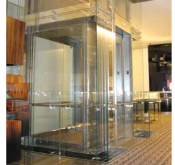
Stainless steel and glass elevator shaft

On the mezzanine level, more partition walls of steel and glass are found. The glass inserts are monochromatic and give an element of dynamism to the walls. The steel finish is once again, non-directional and ties the mezzanine design to the lower levels. Antiqued mirrors are mounted to the column faces in the hallway that lead to the private sales area which is separated by a starfire 1/2" glass door with steel locking mechanisms, steel transom and sill for extra rigidity and strength.