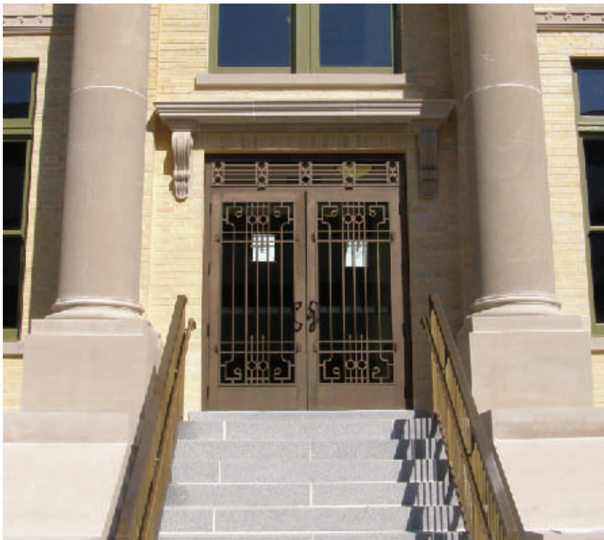
Exterior entrance doors and railings.