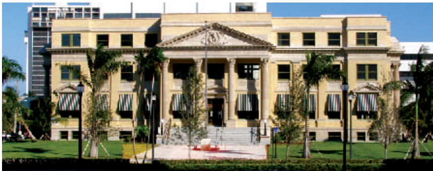
The Historic 1916 Palm Beach County Courthouse

Highlights - Exterior Ornamental Railings - Bronze handrail and posts with patina and lacquer finish Interior Ornamental Railings - Stained Wood posts, painted steel pickets, laser cut decorative motif, powder coated paint finish. (1) Exterior Canopy - Fiberglass and steel construction, with a suspended metallized painted finish (SMF), then orbitally finished and patinaed. (3) Exterior Entrance Doors - Custom aluminum doors, with a suspended metallized painted finish (SMF), then orbitally finished and patinaed. (2) Exterior Aluminum Gates with a painted powder coated finish.