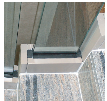
Structurally engineered glass shoes and risers