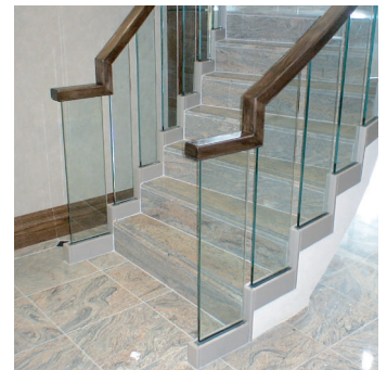
Tempered glass panels and solid oak top rails