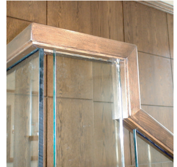
Close-up of solid oak top rail

Highlights - The spiral railing design features faceted clear 1/2" thick tempered glass panels with polished edges and painted aluminum risers and shoes. The curved top rail was made from solid oak and stained to match existing wood trim and paneling.