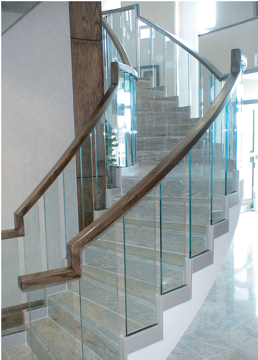
Clear tempered glass panels, painted aluminum risers and shoes, and a curved oak top rails