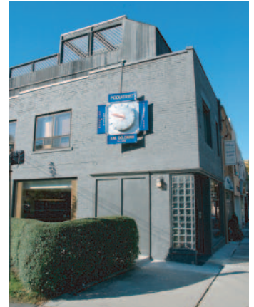
St. stl. exterior clock sign is angle mounted to maximize visibility

Highlights - The clock features non-directional brushed st. stl., with polished st. stl. clock markings. The clock face is accented with 3 ft. long, red clock hands, and a white faceplate ring. The banners are made with blue, weather resistant, vinyl with yellow text. The clock is angled from the building wall to maximize visibility.