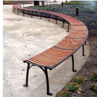
Curved cast benches without back