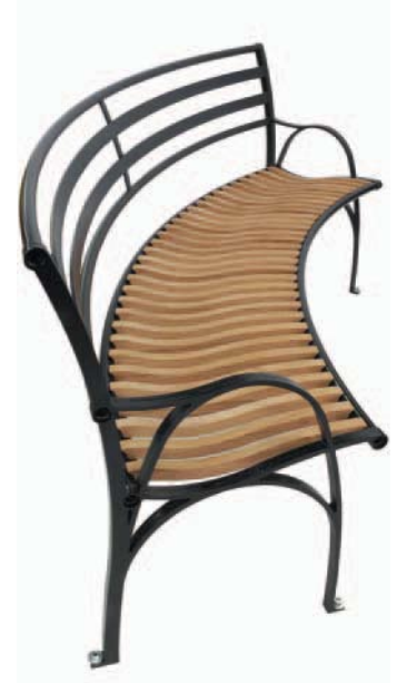
Single curved cast bench with back