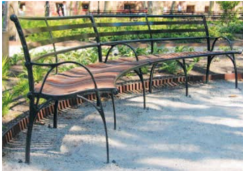
Professionally crafted artistic benches