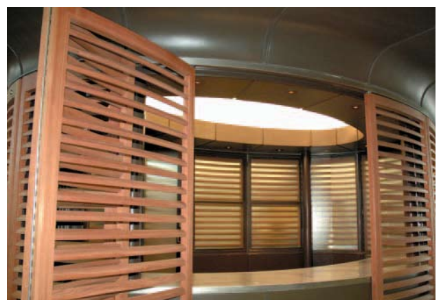
Front doors of kiosk, made of solid jatoba, revealing stainless steel counter