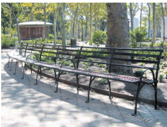
Custom bench and kiosk