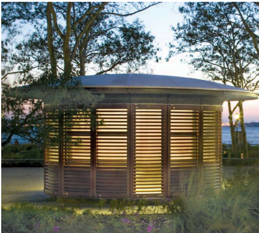
Food and beverage kiosk on the tip of Battery Park, overlooking the Hudson