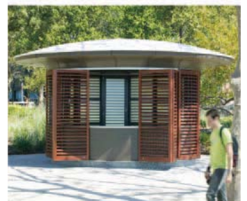
Kiosk with doors open