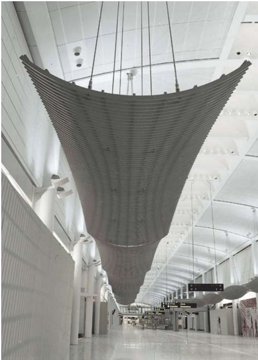
Aluminum suspended canopies

Highlights - This fast-tracked project was complete in less than three months from receipt of concept drawings. Three-dimensional drawing software was unable to predict the final suspended shape of the canopies, so our team constructed a scale model that confirmed each slat formed the desired undulation envisioned by the architect, prior to manufacturing.