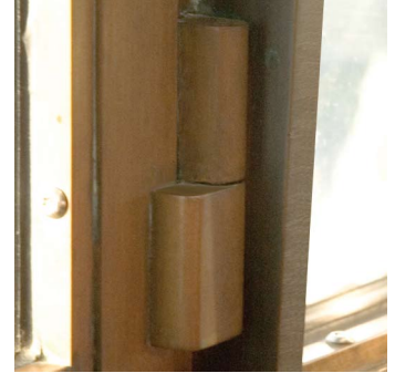
Alloy 230 custom made red brass hinges

Highlights - Bronze window casing system, including ribs, sills and trim constructed with mitered and brazed Alloy 385 Extruded Architectural Bronze with Alloy 230 Red Brass fittings and hinges. Gutters, gutter screens, drip trays and rainwater leader covers all fabricated with Stainless Steel. Included is galvanized steel and bronze ductwork and modifications to brass handrails throughout the observation deck. The total system is air-tight and condensation resistant using state of the art glazing and sealing. All exposed metal has a brushed finish.