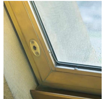
Custom crafted single keyed bronze locks