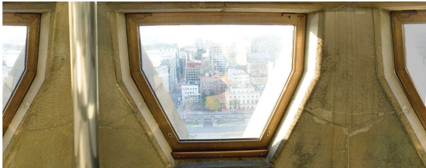
Custom crafted trapezoidal bronze windows surround the lower portion of the observation deck