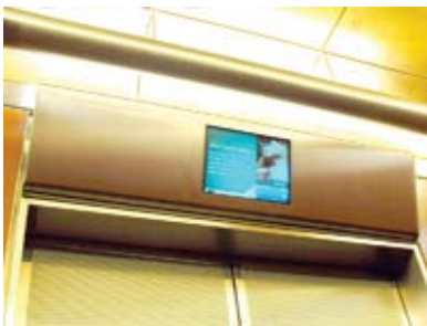
Custom Built Display Housing

Highlights - Features include aluminum ceilings enhanced with 23 carat gold leaf, anigre veneer panels, stainless steel handrails, stainless steel reveals, compact fluorescent energy efficient up-lighting, wire mesh stainless steel doors, segmented digital position indicator and custom built stainless steel display housing.