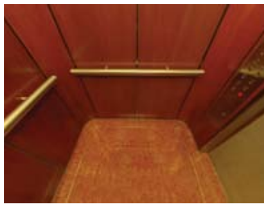
Stainless Steel Handrails & Granite Flooring