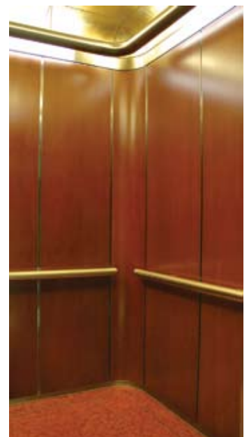
Real Wood (Anigre) Veneer Panels