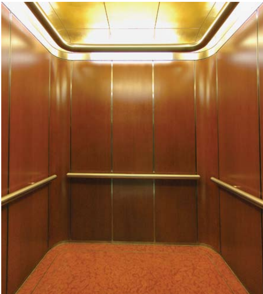
Full View of the Cab Interior.