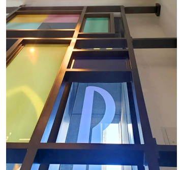
The frame and embeds as viewed at eye level

Highlights - This massive public artwork is constructed of a welded and painted aluminum frame and specialized annealed, laminated, coloured safety glass, framed and mounted within the structure. The complete structure is 22.5' tall x 27' wide. Twenty two (22) framed and distinctly coloured glass pieces mounted into aluminum frames are the principle feature. The structure is secured with special embedments design manufactured by Soheil Mosun Limited into the existing substrates.